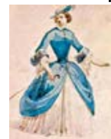
Violetta's costume designed by Giuseppe Bertoja for the premiere of La Traviata