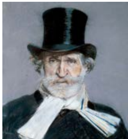
Giuseppe Verdi 1813 - 1901

Born October 9 or 10, 1813, in northern Italy during its Napoleonic occupation, Giuseppe Verdi displayed an early interest in music. At age nine, he was playing the church organ in the small town of Busseto. Over the next nine years, the townspeople became sufficiently impressed with Verdi's musical abilities to raise the money to send him to the Conservatory in Milan. At age 18, however, Verdi was considered too old (14 was the average age of the students) and not talented enough for the Conservatory.